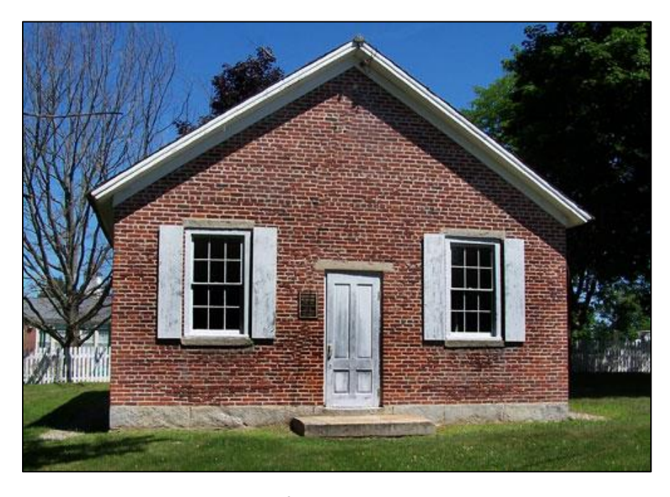
Quasset School on the grounds of the Woodstock Elementary School on Frog Pond Road