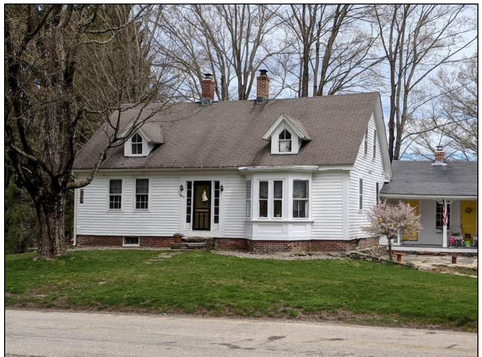
View of the Lois Banister House from Center Road, view north.

The Lois Banister House was designated a Local Historic Property in December 1991.